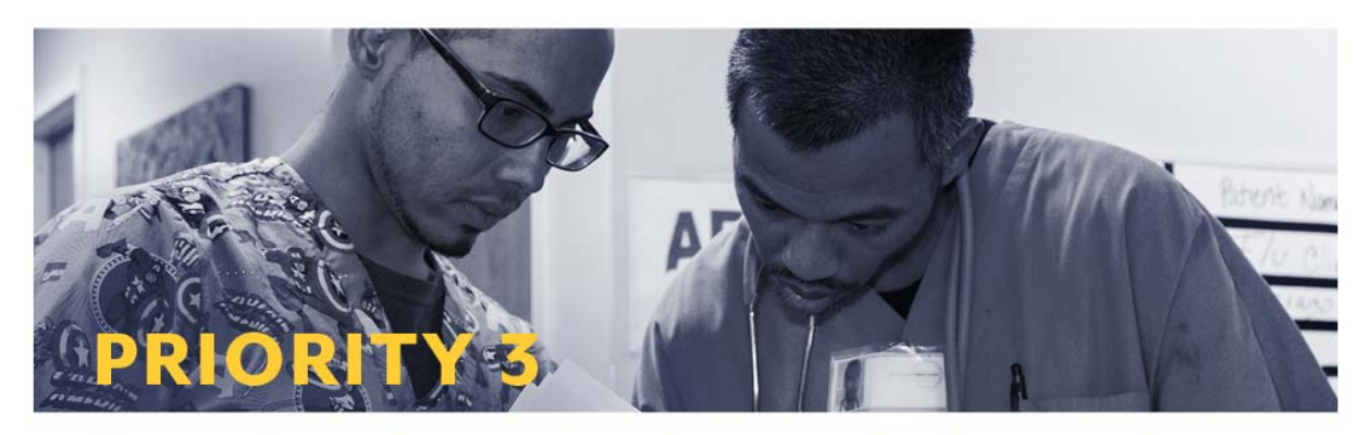
Teach Core Concepts of Health System and Practice Transformation

To realize the potential of health systems transformation, the healthcare workforce will require new knowledge as well as renewed skills. Chief among them are a deep understanding of the "drivers" of system and practice transformation, including integrated team-based care, population health, value-based payment, social determinants of health, health disparities, and health data analytics. These concepts need to be incorporated into both professional preparation for those entering the workforce and continuing education for active practitioners at all levels. Doing so requires both collaboration across disciplines of health and social services and renovation of curricula and pedagogy within health professional programs. For those already in the workforce, employers need to rethink organizational routines and schedules to accommodate continuous learning. Of special importance is education in practice transformation—teaching team members to work collaboratively, apply metrics to monitor outcomes, and improve workflow, among other skills, to improve the quality of care and patient satisfaction.