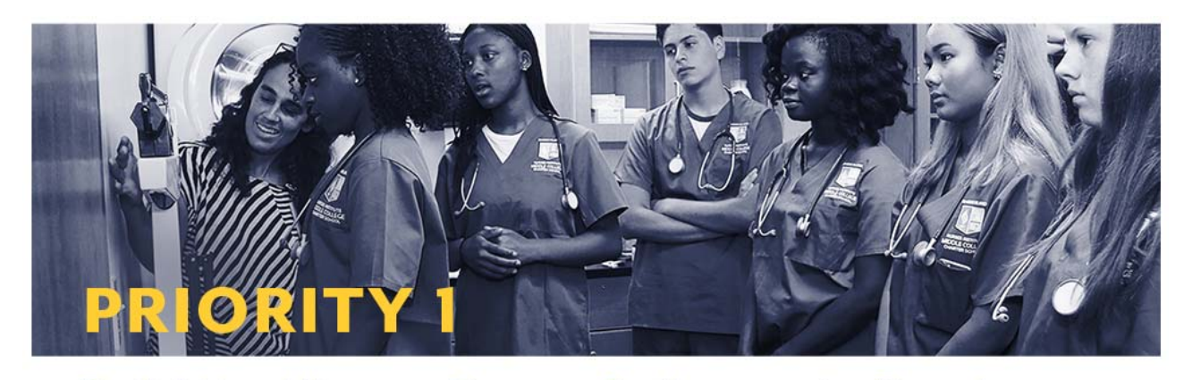
Build Healthcare Career Pathways to Develop Skills That Matter for Jobs That Pay

The following strategies respond to the need to educate, recruit, and retain skilled practitioners at every level of the healthcare workforce, from entry-level roles at the bedside, home, or community health clinic, to clinicians and behavioral health professionals. They offer ways to prepare Rhode Islanders from culturally and linguistically diverse backgrounds for good jobs and careers in healthcare through expanded career awareness, job training, education, and advancement opportunities. They also pose solutions to provider shortages in strategic occupations.