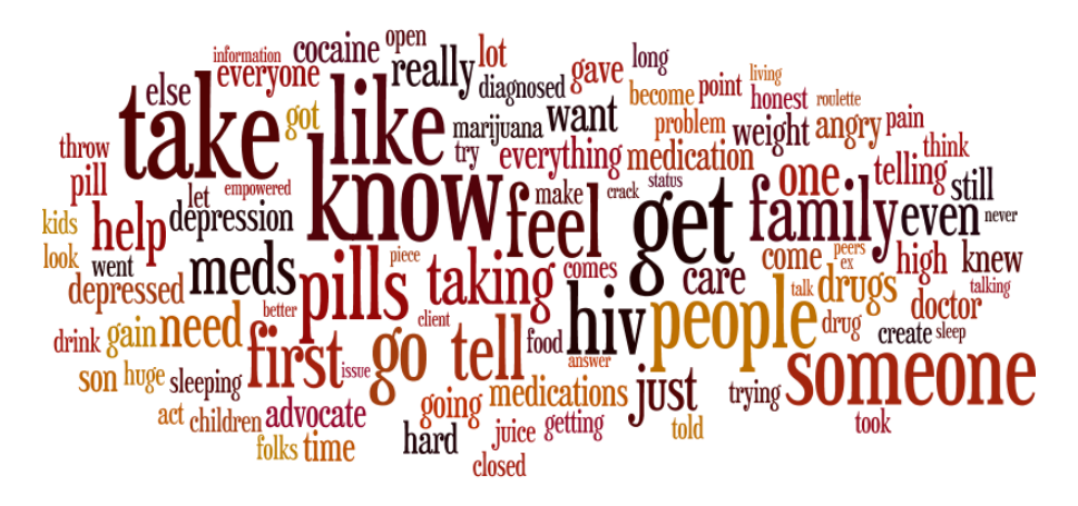
Figure 5: Self-Care Wordcloud