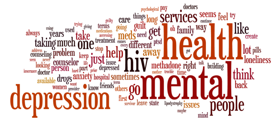
Figure 2: Mental Health Wordcloud