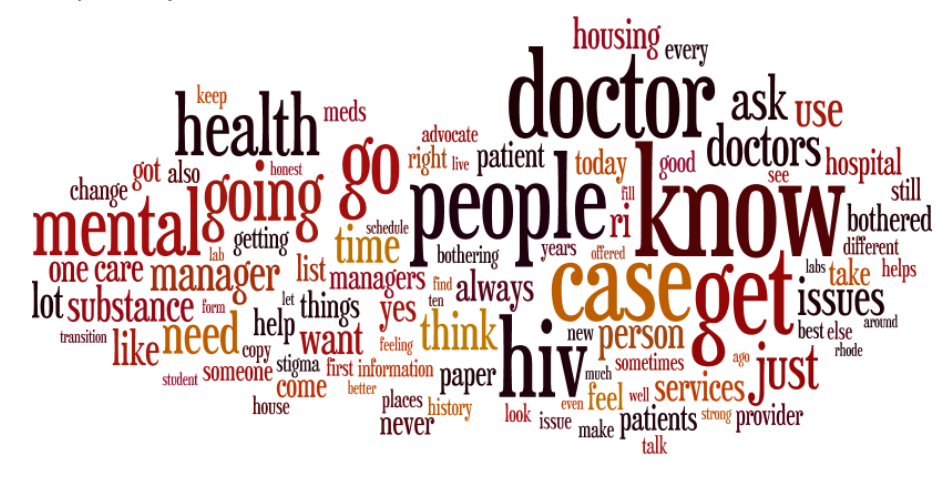
Figure 4: System of Care Wordcloud