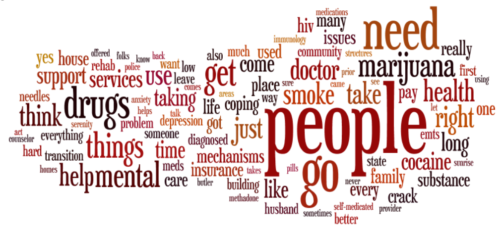
Figure 3: Substance Use Wordcloud