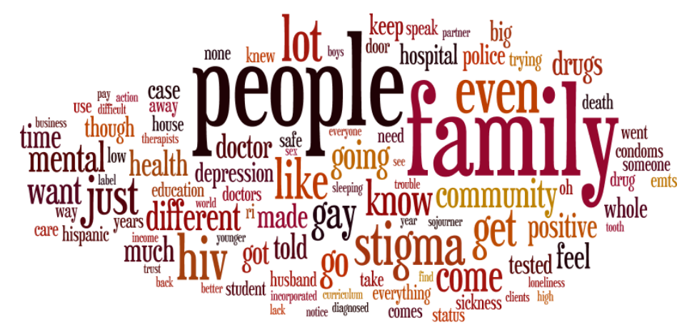
Figure 6: Other Wordcloud