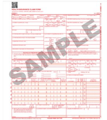
CMS 1500 Claim Form Example