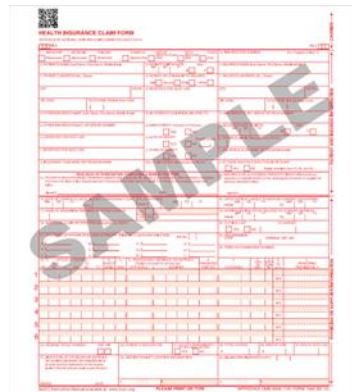
CMS 1500 Claim Form Example